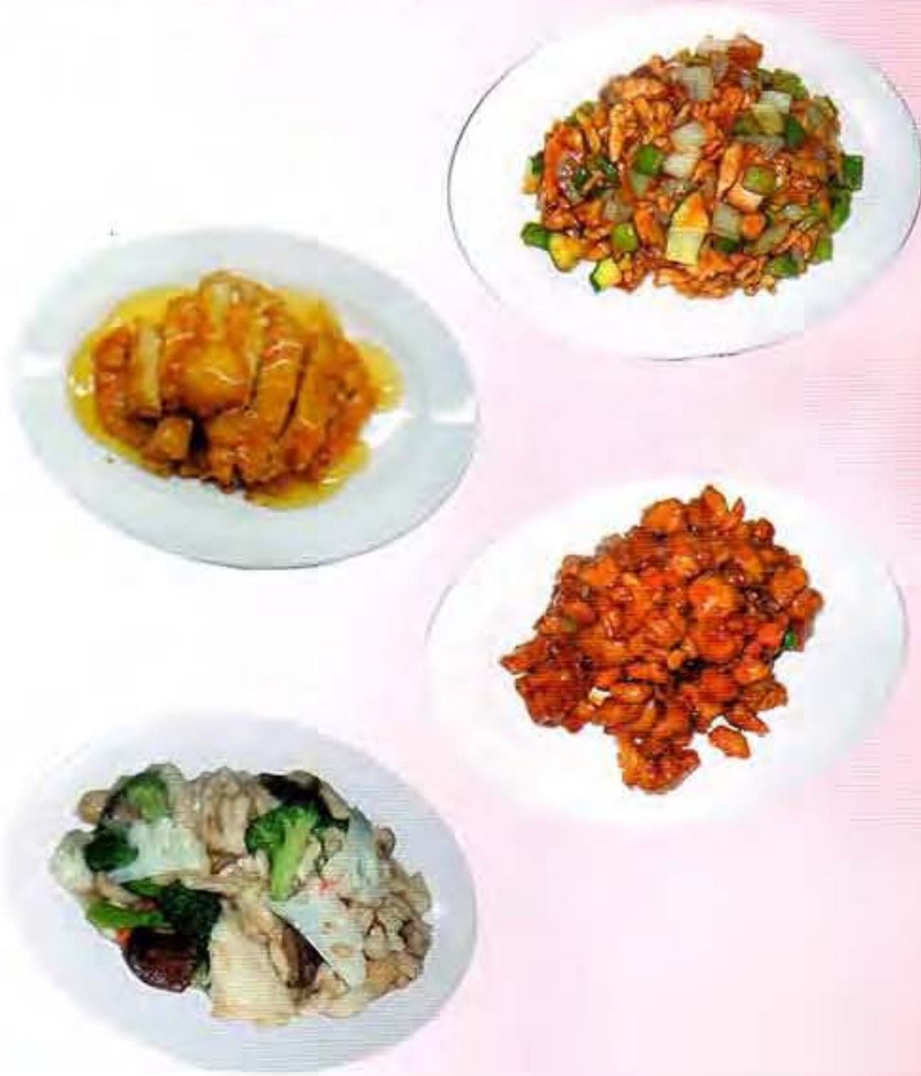
Hot & Spicy